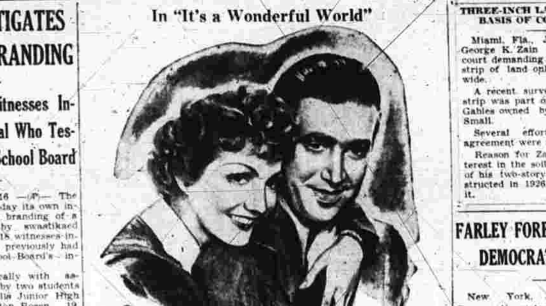
A candid moment from "It's a Wonderful World" in which Charles Coburn and James Stewart are seen to be seen on the State Theater screen.